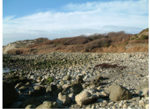
Picture above is Watershoot Bay , showing boulders of greensand and chalk with the land-slipped terrain beyond.

This beach at the southern tip of the Island is composed of sandstone, chalk and chert boulders (110 to 90 million years old) which are rich in fossils, including ammonites, shells, sponges and fossil worm cases . Formed during ancient landslips, it is a very beautiful area to collect fossils from, and can be accessed even at high tide. St Catherine's is located approximately 40 minutes away by coach. The beach itself is approximately 15 minutes walk downhill from the drop-off point at The Buddle Inn. At least 20 minutes should be allowed for the climb back. There are no public toilets at St. Catherine's.