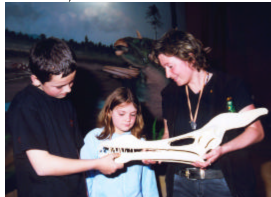
Picture below Children examining a reconstruction of the skull of a new species of pterosaur ( Caulkicephalus trimicrodon ) found at Yaverland.