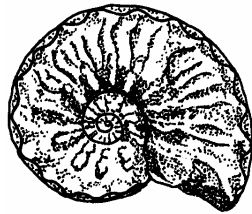
Picture to the left Schloenbachia varians is a common variety of ammonite that can be found on the beach at St. Catherine's.