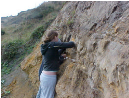
Picture above Fieldwork on the Barnes High Sandstone Member.

Recording the water-rippled upper surface of this former sandy river delta from the Early Cretaceous Vectis Formation at Yaverland.