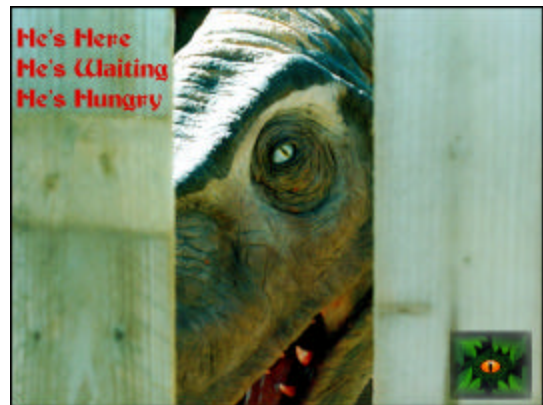
Picture above Neovenator salerii looking out of its packing case in 2001.

The geological collections originally came from a museum in Newport founded in 1819 by the Isle of Wight Philosophical Society. The geological specimens from this collection were transferred in 1913 to the Sandown Free Library which opened to the public in 1923 as the Museum of Isle of Wight Geology. In 2001 the collection moved up the road to Dinosaur Isle at Yaverland. In a few years time our historically-important collection will celebrate its bicentenary.