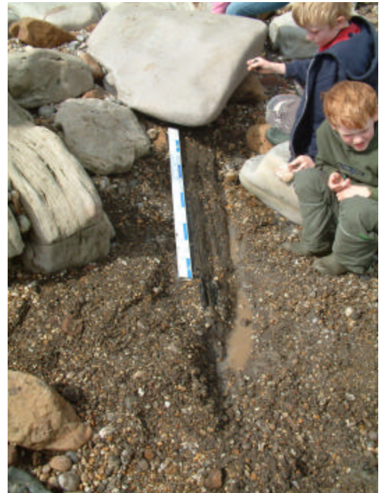
Picture to the right Children at Yaverland; measuring a large, partially buried fossil tree trunk.