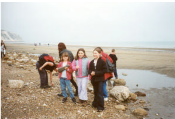
Picture above Collecting fossils on the foreshore at Yaverland.

At Yaverland the beach changes each week we visit it. The tide moves the sand around, and in the autumn and winter months it can sometimes be stripped bare of sand. This exposes many of the larger fossils, like the natural foot-casts left behind by the large herbivorous dinosaur Iguanodon (Seen below).