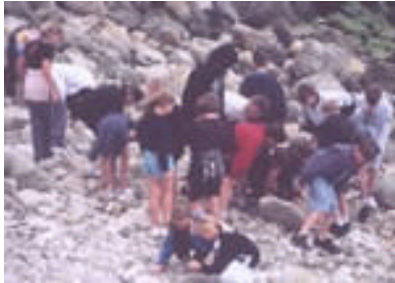
Picture above Children at St. Catherine's, collecting ammonites